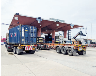
LAT KRABANG INLAND CONTAINER DEPOT